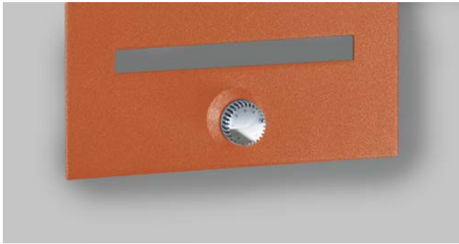
Completo version with integrated valve